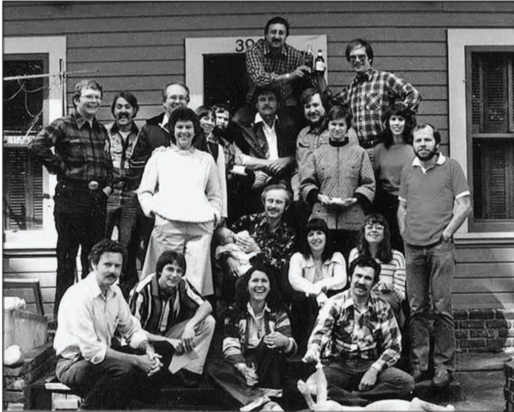
OBA meeting 1980

The next few meetings focused on some hands-on projects such as having a booth