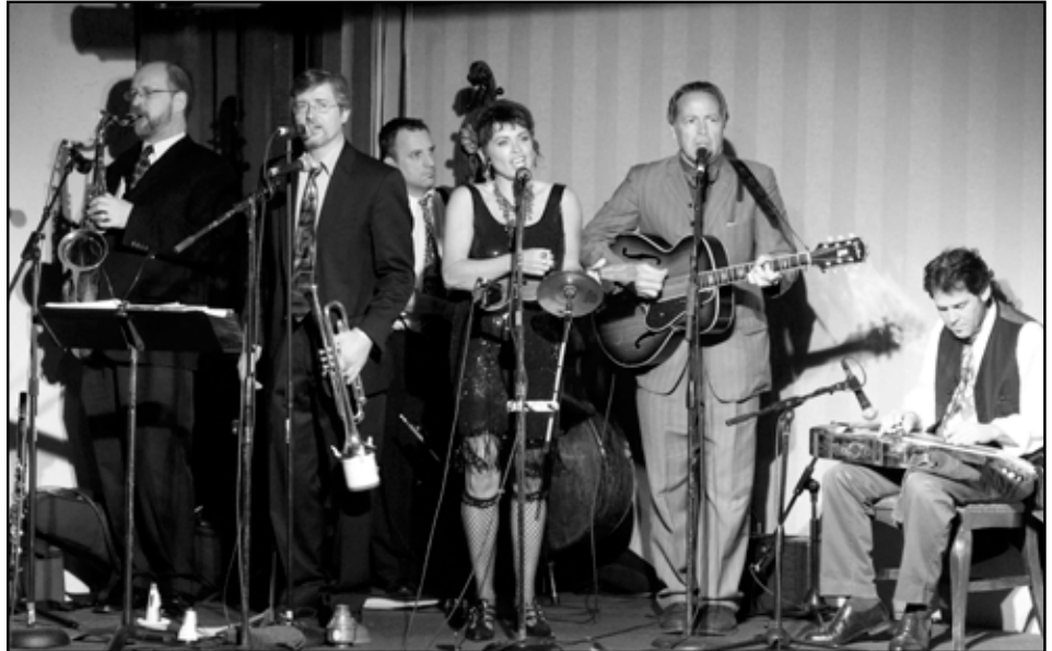
The Midnight Serenaders kept the dance floor busy

I hope to see you all down the road at a festival in 2012.