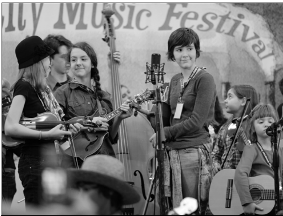
The Chick Rose School of Bluegrass had a great turnout at RiverCity

One could never say enough about the incredible musicians booked for our enjoyment. I heard so many rave reviews for so many of the acts, I will not single any out, but all were well received. My last tidbit of love goes out to the WBA,