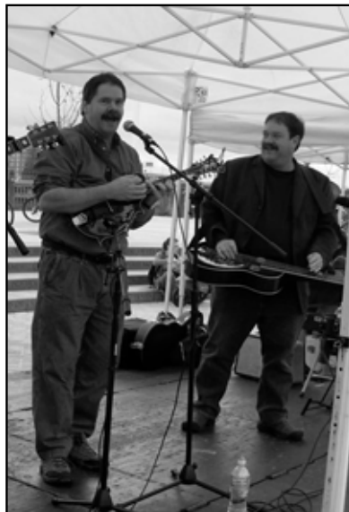
Steer Crazy: Brothers at work!